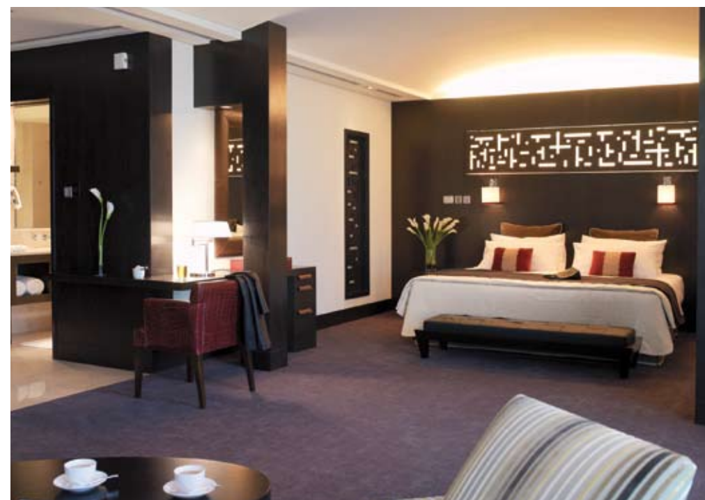
Modern and comfortable, our Superior and Executive suites guarantee a luxurious night's stay.