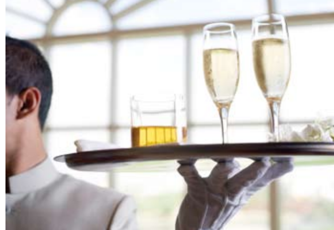
Relax in Monty Cristo's Cigar Lounge or by the pool at Aquaviva Café.